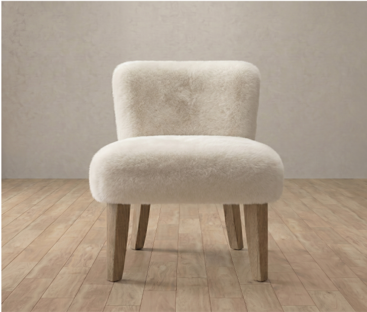
Articture – Aspen Cloud Dining Chair